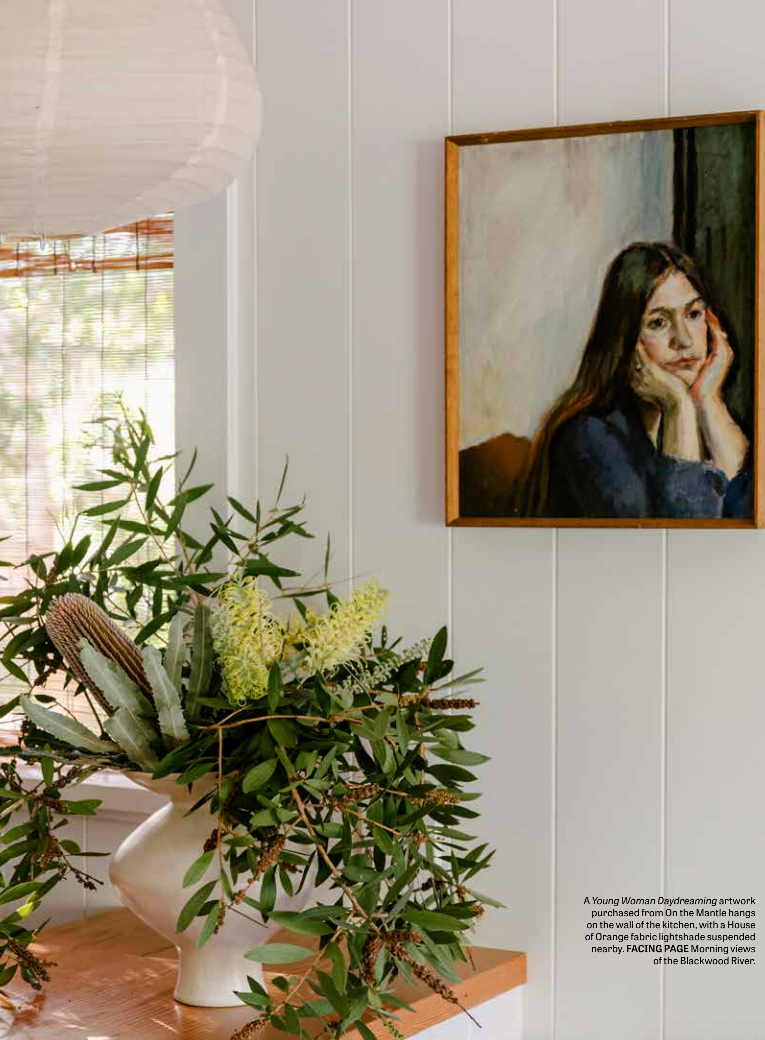
A Young Woman Daydreaming artwork purchased from On the Mantle hangs on the wall of the kitchen, with a House of Orange fabric lightshade suspended nearby. FACING PAGE Morning views of the Blackwood River.